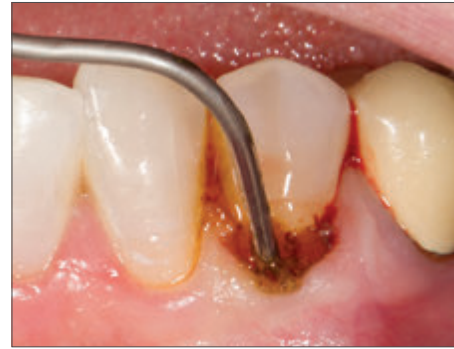
2 Astringedent X hemostatic is scrubbed firmly against bleeding tissue.