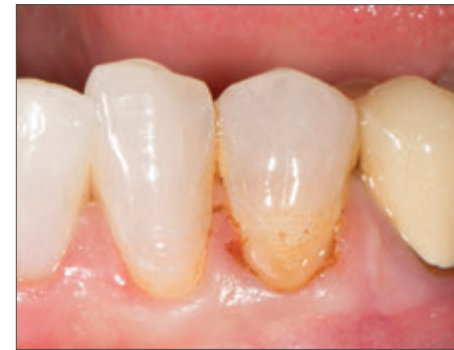
4 Profound hemostasis.