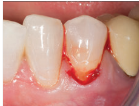
1 Bleeding at preparation.