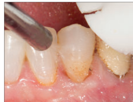
3 When bleeding stops, give a firm air/water spray to test for hemostasis and remove coagulum.