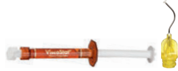
3093 - ViscoStat Dento-Infusor Syringe Kit 4 x 1.2 ml syringes 20 x Metal Dento-Infusor tips